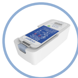
Inogen One ® G5 Extended Life Lithium Ion Battery** Up to 13 hours run time Item #BA-516