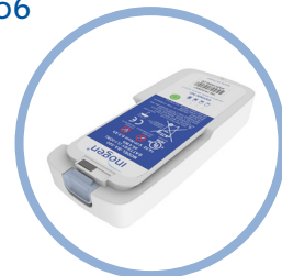
Inogen One G5 Lithium Ion Battery* Up to 6.5 hours run time Item #BA-500