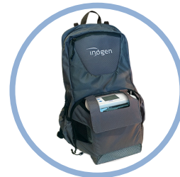
Inogen One G5 Backpack** Item #CA-550