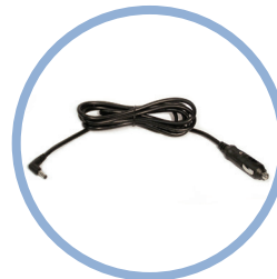
Inogen One G5 DC Power Cable* Item #BA-306