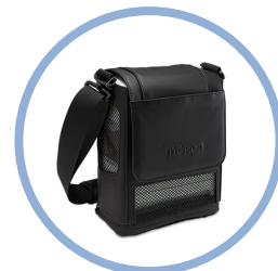
Inogen One G5 Carry Bag* Item #CA-500